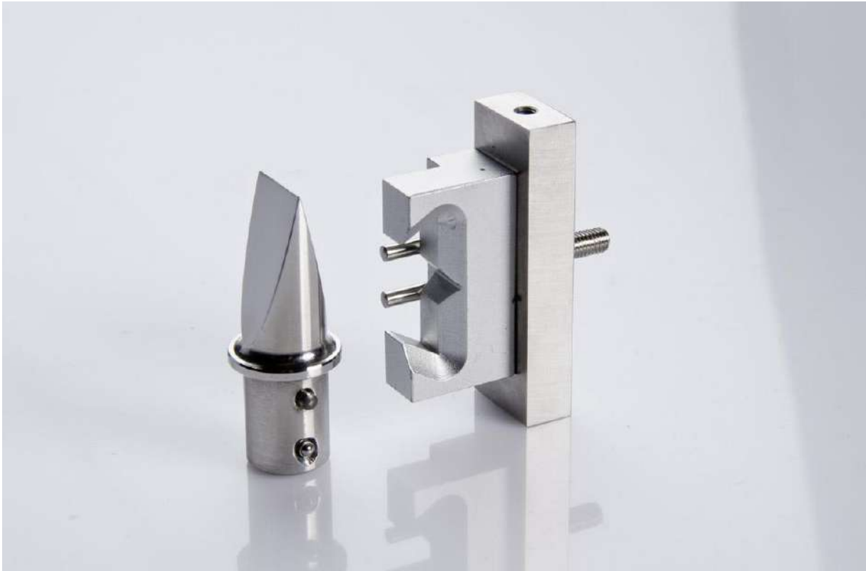
Tension Strength Test Set to test tablets having a break-line (29-28550/52/53/55)